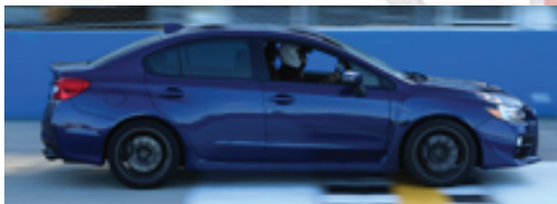
MILWAUKEE TRACK DAYS